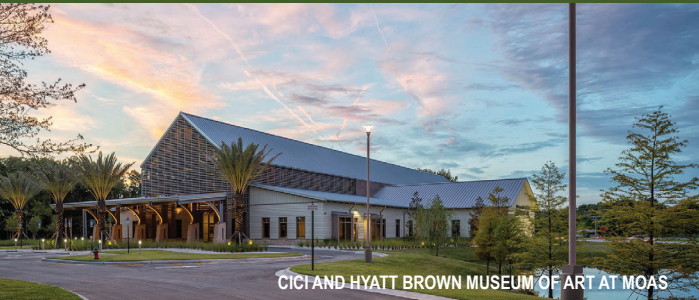
CICI AND HYATT BROWN MUSEUM OF ART AT MOAS

The Museum of Arts & Sciences is one of the premier cultural destinations in Volusia County. Our success makes the entire Daytona Beach area a better place to live, visit, and do business. By joining as a corporate member, your company helps to secure the Museum's vitality on an annual basis. But more importantly, the Museum provides its corporate members with unique opportunities to engage employees, entertain clients, and promote your brand at the leading art, science, and history institution in our region.